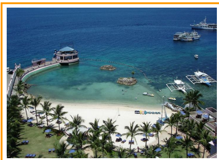
▲ Boracay Island

My first stop is to Boracay Island. It is most famous for the beautiful beach with pure and white sand, which is 5 kilometers long shown like below picture.